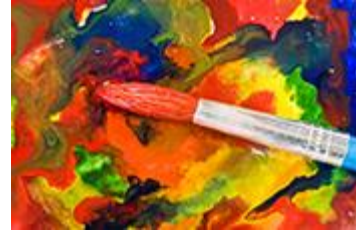
Cancer Survivors Virtual Art Show