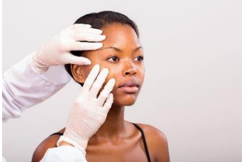
Top 5 Reasons to Not Delay a Skin Check